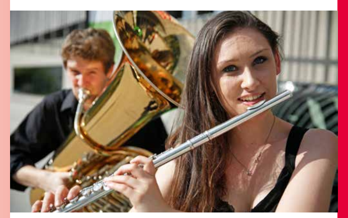
Mid EUROPE is supported by:

In addition Mid EUROPE since the 20th anniversary in 2017 is hosting the WAWOP (WorldAdultWindOrchestraProject) for musicians age 30+.